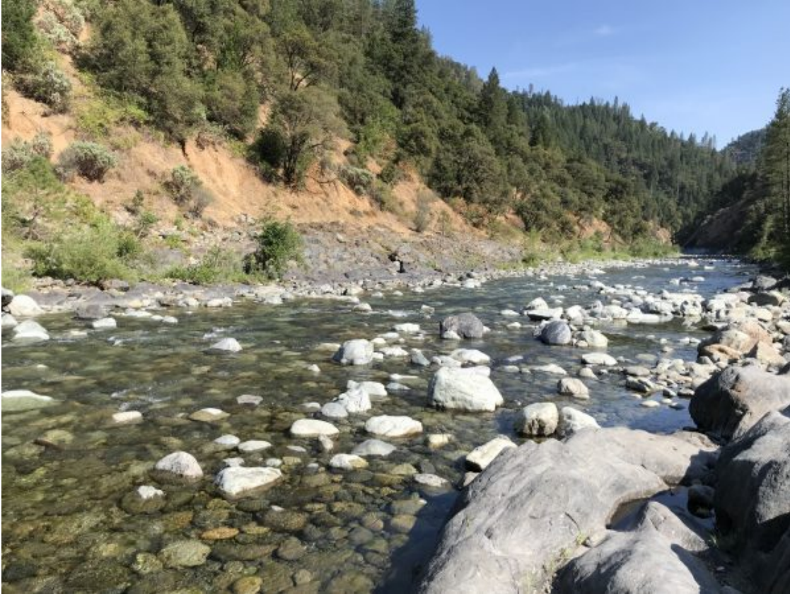
American River North Fork outside Colfax, California, July 2018.